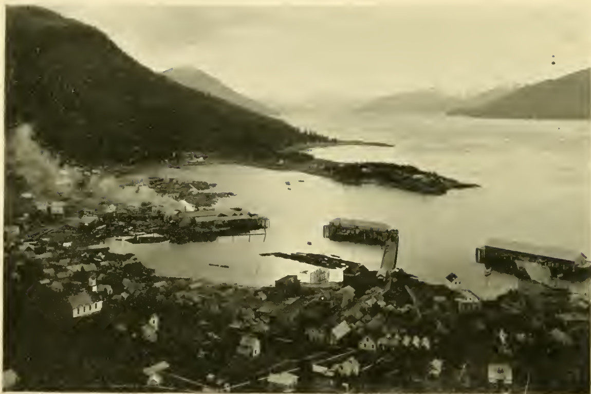
Wrangel from Mount Dewey.